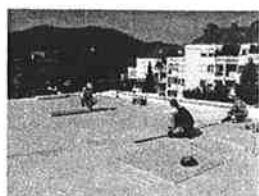
Figure 1. Typical workplace situations for tinsmiths: working with reflective materials.

As the investigated occupational group is often working on highly reflective surfaces (e.g., copper and aluminum roofs, Figure 1) even the workers' eyes accumulate high